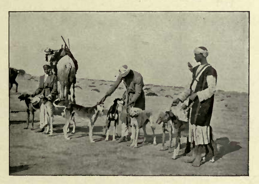
SLUGHIS ON THE EGYPTIAN DESERT.

Again through Egypt which affords records of pre-Israelitish Palestine, a glimpse is given of these dogs in the desert beyond Jordan. May not these early allusions tend to the acceptance of the use of the word